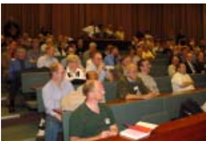
The lecture theatre at the Cavendish Laboratory.

in the warmer southern spring and summer seasons of the Martian year, and this was the case in 2001. A storm blew up in the Hellas basin, and on June 26 spread beyond this locality. A second storm grew from a separate source in Claritas-Daedalia, on the opposite side of the planet, and the two rapidly merged to form the first planet-encircling storm for decades. The best estimate for the duration of the storm was 185 days, although such durations are difficult to measure accurately due to the subjective nature of when a storm is deemed to have cleared.