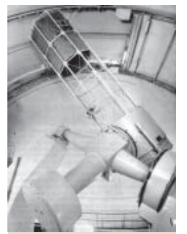
Destroyed: The 74-inch (Grubb–Parsons) reflector

The 30-in Reynolds reflector was installed at MSO in 1927–30, but only became a popular research instrument after WWII. It has been used ever since, mainly for photoelectric photometry. This telescope was donated to the Australian Government by the wealthy