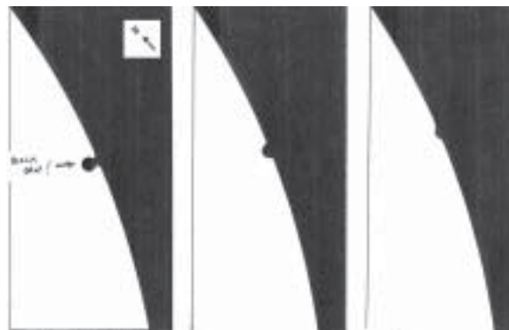
II. Egress. Left: 10.28 UT, transp. poor, seeing II. Centre: 10.30 UT, tr. fair, seeing II. Right: 10.31 UT, tr. fair, seeing II.

Reports have been received from about a dozen observers. Although the Sun was well clear of the horizon at first contact, none of the British observers saw the ingress as their view was obscured either by low cloud or buildings. At the egress most obtained a sat