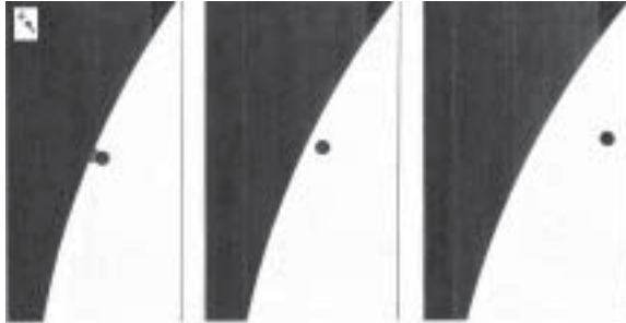
Drawings by Massimo Giuntoli, Pistoia, Italy, using an 80mm f/5 achromatic refractor stopped at 40mm, \times 40 , with 45^\circ erecting prism and astrosolar filter. I: Ingress. Left: 05.17 UT, transparency poor, seeing IV. Centre: 05.20 UT, tr. poor, seeing IV. Right: 05.32 UT, tr. fair, seeing III. The observer notes that the disk of Mercury is slightly darker than the umbra of sunspots.

The planet Mercury crosses the face of the Sun thirteen or fourteen times a century, and this year's transit was the first to be visible from the British Isles since 1973 November 10, when most observers were clouded out. It occurred at Mercury's descending node with the planet crossing the northern part of the Sun's photosphere. In the British Isles the transit was visible in its entirety from 05h 00m UT until 10h 33m, the least distance of centres ( 11'42'' ) occurring at 07h 52m, and it was widely seen, the weather conditions being generally favourable. During a transit, Mercury appears as a small black dot silhouetted against the brilliant disk of the Sun. Due to the large eccentricity of the planet's orbit, there is a considerable variation in the circumstances of its transits; the duration of a central transit ranging from 5\frac{1}{2} hours in November when Mercury's apparent diameter is 10 arcseconds, to 8 hours in May when the apparent diameter is 12 arcseconds. In either case Mercury is too small to be visible without optical aid, but its progress across the Sun may be followed by projecting an image through a small telescope onto a screen.