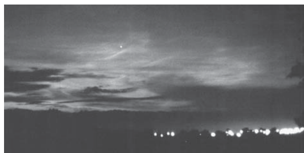
NLC on 1999 July 4, photographed by Neil Bone using a 2s exposure with 50mm f/2.8 on Kodak Elite slide film

Mid-July sees a marked upturn in overall meteor rates, as several of the radiants in the Capricornus/Aquarius region become active. Most obvious are the Delta Aquarids, whose