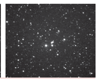
Summer binocular targets: open clusters in Cygnus. Left: M39; right: NGC 7058.

A couple of degrees south of Gamma Cygni, M29 (NGC 6913) is more compact, with a diameter of 7 arcminutes. Here can be