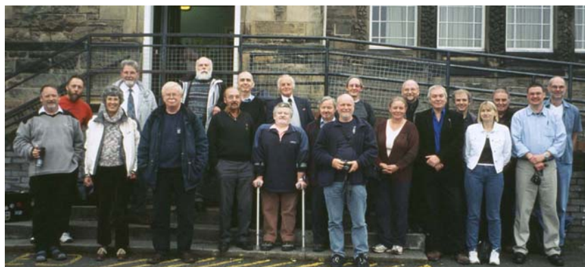
Delegates to the Scottish Astronomy Weekend at the Cowane Centre, Stirling.