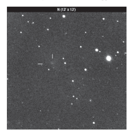
Comet 2P/Encke on 2007 February 6. Celestron 14 + SBIG ST9XE CCD, 4×120 secs.

Without doubt the most notable event of recent weeks had been the appearance of Comet 2006 P1 (McNaught). This had reached many newspapers, where it had been hailed as the greatest comet since Hale–Bopp (1997). Such attention was perhaps surprising, given that the comet was visible from the UK for only one week, around January 7–14, and then only in evening twilight, for a few minutes each day. Furthermore, the apparition