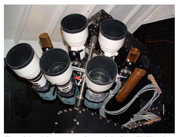
Five of the eight cameras of one of the SuperWASP units – mountings for the remaining cameras can be seen alongside.

until 2020. The Darwin observatory - a space-based constellation of four telescopes planned by ESA - would not only image exoplanets, but also take their spectra. This would allow the composition of their atmospheres to be studied. Atmospheric scientists had identified certain features, termed biomarkers, which, if detected in an exoplanet spectrum, were thought to be sure indications of the presence of life. One example was ozone -O_3 – which indicated the presence of free oxygen atoms in a planet's atmosphere. Over time, one would expect free oxygen to react with rocks to become bound up in minerals; a continuing supply indicated replenishment and in turn respiring organisms. As with the ELT, however, Darwin's work was some years distant: it was scheduled for launch around 2015. The remainder of this talk, therefore, would look at what was possible with current instrumentation. There were indirect techniques for detecting exoplanets, which did not obtain images of the planets themselves, but which inferred their presence by detecting their influence on their host stars.