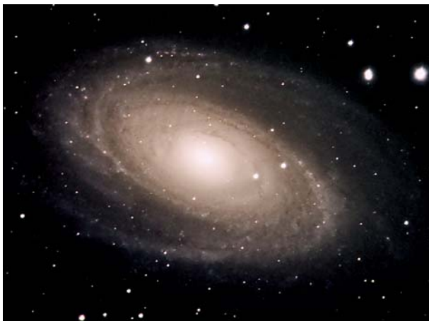
Galaxy M81 imaged by Peter Edwards on 2010 March 7 with a Celestron C11 at f/6.3 and SBIG ST2000XCM CCD camera. 18x300sec sub-exposures stacked to give a total of 90 minutes.

be a nice conjunction of Mars and Saturn, with Venus nearby too, which could make a nice little photo composition.