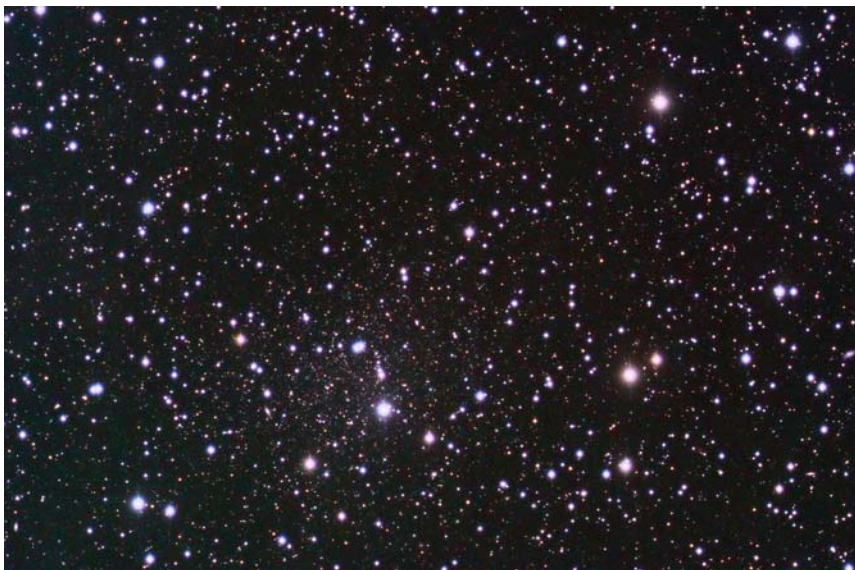
Image of UGC 10822 the Draco Dwarf Spheroidal Galaxy. Imaged from Tenerife with a Pentax 105SDHF and SBIG ST10XME camera