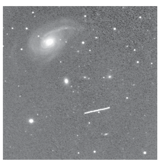
NEO 2003 UV11 streaks across the sky near galaxy NGC 772 in a 6-minute stacked exposure. 3×120s, 20:07-20:13 UT, 2010 Oct 27.

Dr Trotta is involved with the Herschel/ Planck mission, the objective of which is a full survey of the microwave sky. He began his talk with a model of the universe from 400 BC, calling it a 'good model that lasted until Galileo'. He then showed an animation that zoomed into the sky from the naked eye constellations to the Hubble deep field image. He reviewed Newtonian and Einsteinian theories of gravity, and evidence from the deflection of light by mass. Following this he reviewed models of the universe corresponding to different values of