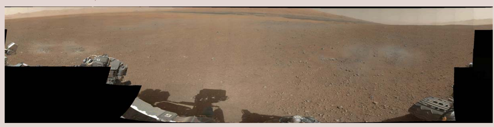
Figure 2. A 360° panorama of Gale crater made with 130 images from the Mast Camera late in the afternoon of August 8. The foreground grey areas were caused by the descent engines blowing away a surface deposit. Preliminary ChemCam data suggest the presence there of pieces of basalt within a sedimentary layer. The distant crater rim can be clearly seen, together with the very large central peak (provisionally named) 'Mount Sharp'. Spacecraft observations indicate layers of clay and sulphate minerals in the lower layers of the mountain, indicative of a wet history. A detailed route to drive there is currently being planned, and the journey is likely to take up to a year to accomplish.

I began writing this note a few days after the sad news of the death of Neil Armstrong (1930-2012), the first man to have walked on the Moon, 43 years ago. In the optimism of the late 1960s, I am sure that Armstrong and his fellow Apollo crew members would