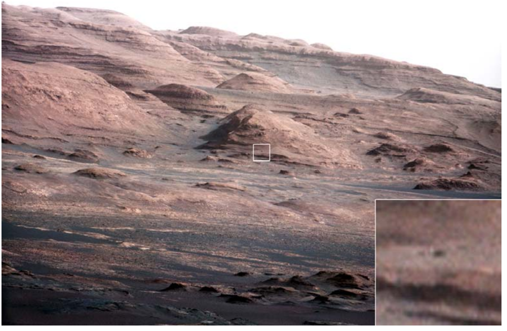
Figure 3b. A close-up view of the lower slopes of Mount Sharp. Colour has been enhanced to help with analysing different areas of terrain. For scale, the highlighted dark rock is about the same size as the Curiosity rover, and the pointed mound behind it about 300 metres across and 100m high.

This article is copyright © the Journal of the British Astronomical Association, <a href="www.britastro.org/journal">www.britastro.org/journal</a>. If you wish to reproduce it, or place it on your own Web page, please contact the Editor: Mrs Hazel McGee, <a href="hazelmcgee">hazelmcgee</a> "at" btinternet.com