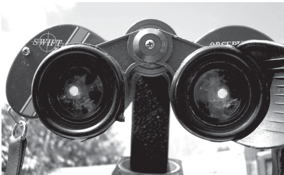
Figure 2: 16x70 with its exit pupil, side guard and clamp.

This writer's age, and light-polluted observing situation, is not amenable to anything above a 5mm diameter exit pupil, but in a (rarely used) dark, unpolluted sky this could change to a 6 - 6.5mm. In light-polluted areas, or using a site surrounded by lights that may stray into the aperture, two dew-shields help the situation and assist keeping optics less damp.