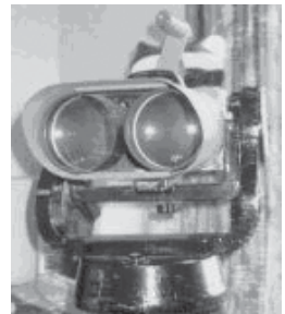
Figure 1: George Alcock's 25 x 105 tripod mounted binoculars.

Several binocular styles relate to optical design, for example, the roof prism, Zeiss porro prism, the terrestrial (straight-through), and Galilean style of opera-glass. Prism quality is also important for the ultimate aim of image quality, with modern BaK-4 type being subtly superior to the BK7 glass. Focussing mechanisms that provide a crisp image are either centre-focus, the most common, or with the eyepieces having their own movement. Though optical distortions, collimation of a faulty instrument and lens coatings were not described in detail, these aspects are worthy of study. In quality binoculars all air-to-glass surfaces are multicoated, which means that ghost images and internal reflections are reduced. The centre bridge, 1