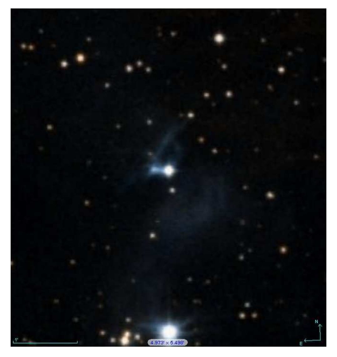
Fig. 1 Digitised Sky Survey colour image of RR Tau and it's associated nebula. The variable nebula can be seen as a bright 'knot' of nebulosity just east of RR Tau itself (centre star). 4.9'x5.5' ( CDS Aladin v7.0 )