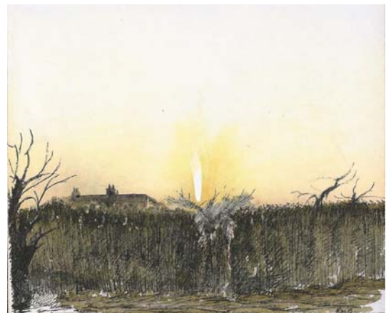
Comet West (1975a) viewed at dawn on 1976 March 2, with heavy frost and a clear, bright saffron sky. Three decades on, Richard wrote to one of the present authors: 'It was a wonderful morning. Not a cloud in sight, a wonderfully transparent sky after a hard white frost. Woke my usual time and dashed into garden and lo! there it was. All the family down in their night attire, straining to see the comet peeping just over the hedge... We even got out the step ladders! I've just rediscovered the rough watercolour I did that day. A fragment of time when all the world was sunny.'

In the late 1960s Richard, together with sev-